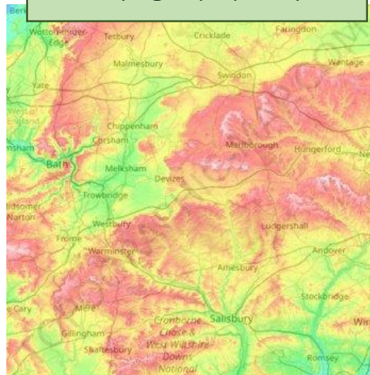
Key features of topography maps (hills, mountains, coasts and rivers)