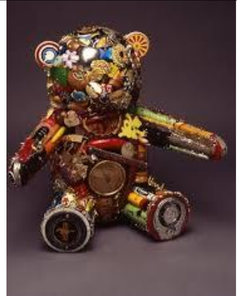
A 3D model made from recycled objects.