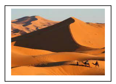
The Sahara Desert is the hottest desert in the world.

Jungles are very hot, but it also rains a lot in jungles. Monkeys, elephants and tigers live in jungles.