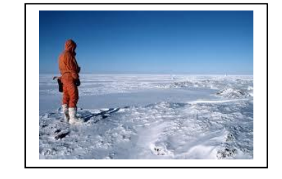
The Antarctic Desert is the world's largest desert.